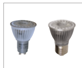
MP10 - 27